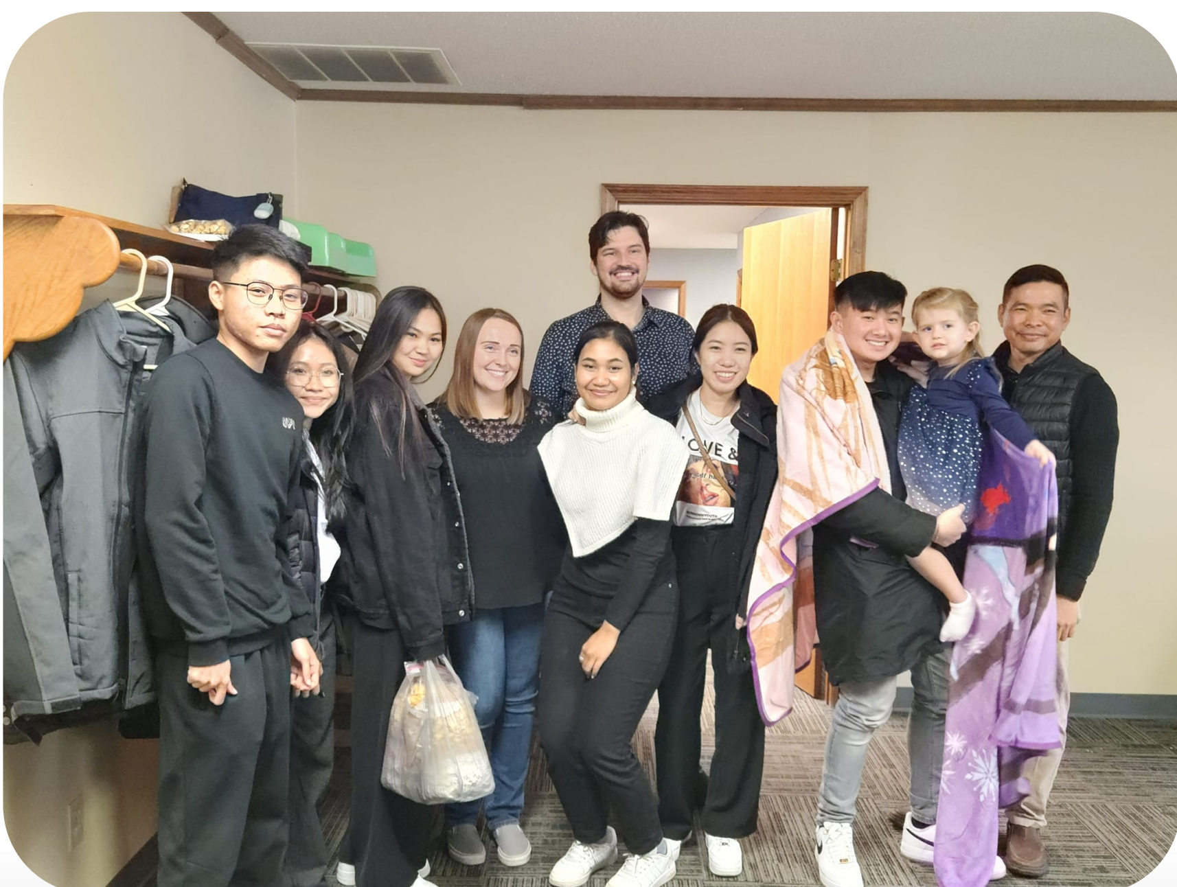
6 young adults from Cambodia who attend college in New York spent Thanksgiving with us! 3 of these students need to know Christ as their personal Savior, pray for them!