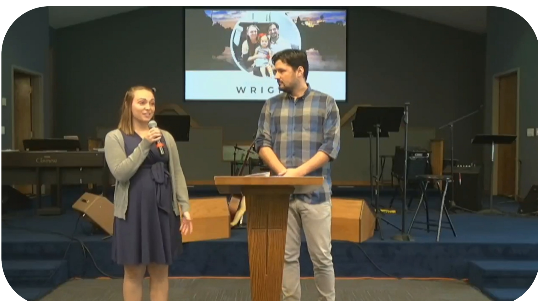
Sharing our ministry @New Hope Baptist Church