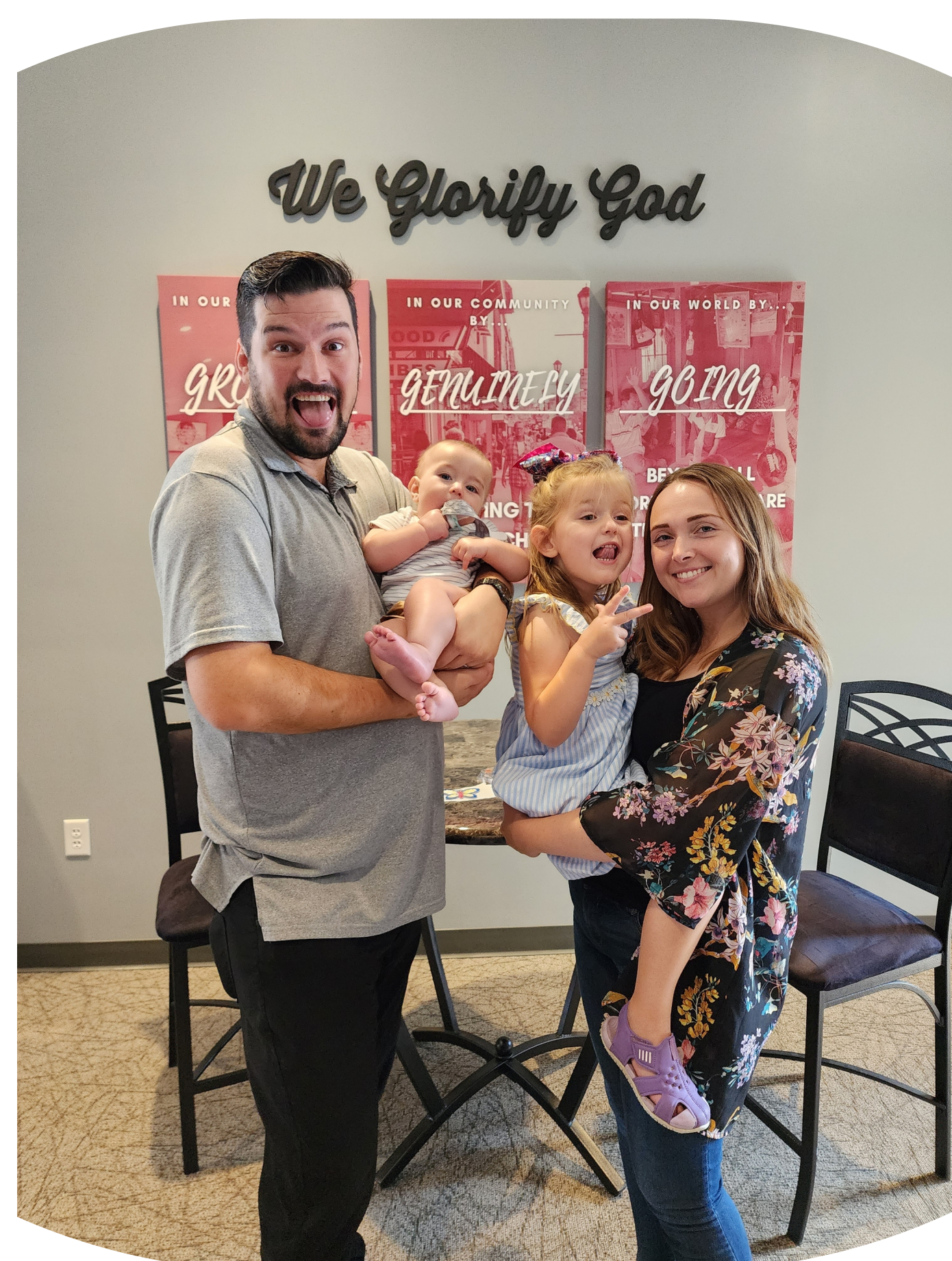
We were able to spend our first Sunday back at New Life on Sept. 3rd. What a blessing!