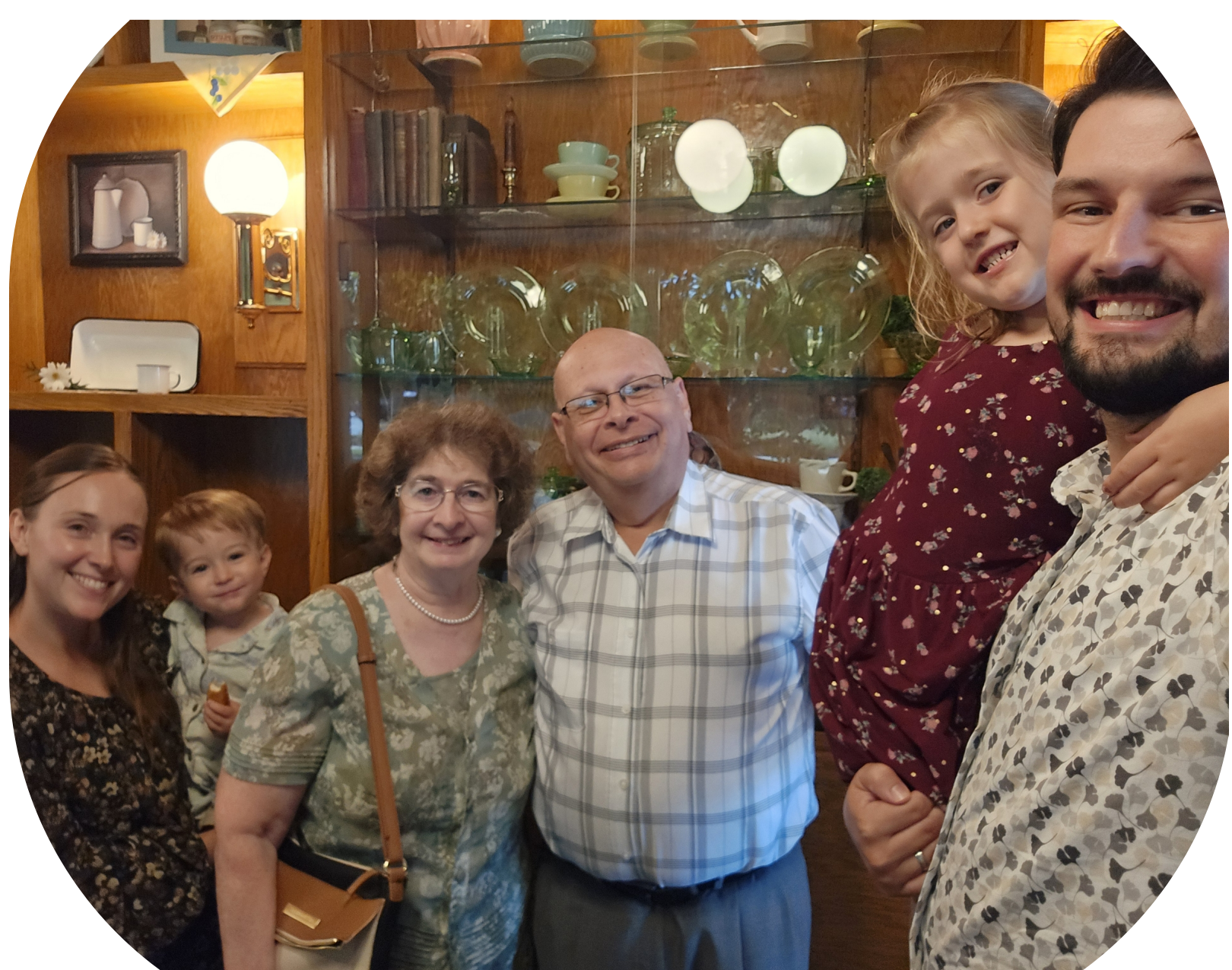
We got to be with some 'old friends' from New Life! Blessed to share our ministry at The Cross!