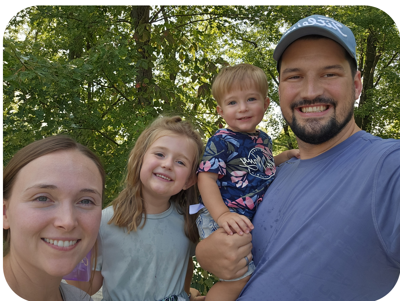
Made it back to the states and spent a few days at home with family before the final 3 months of deputation!

- For continued financial provision for our setup costs as we prepare for our permanent move to Cambodia in January!