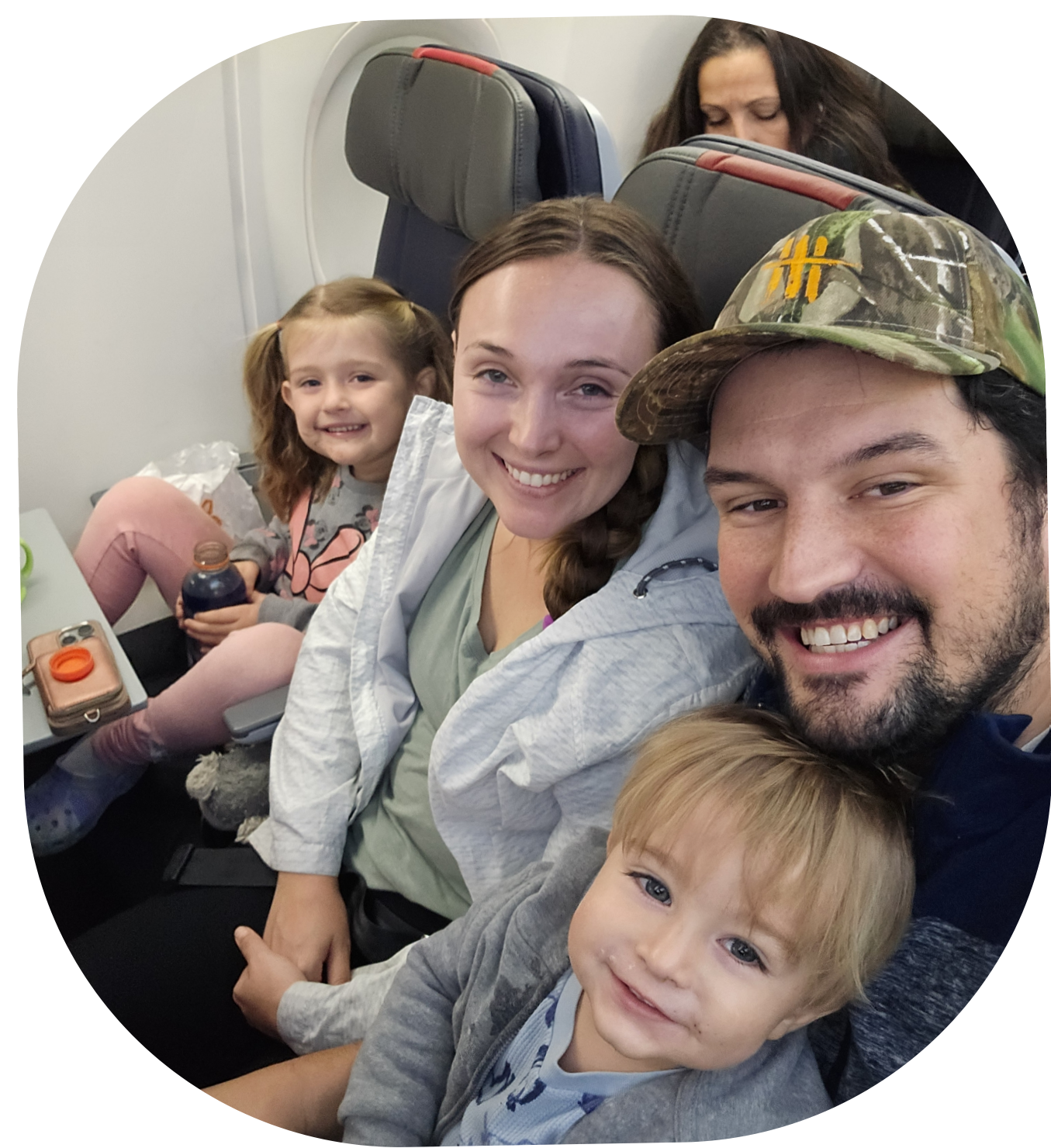
We spent 2 weeks on the East Coast sharing our ministry with some wonderful churches.

Scan the QR Code above to check out our Amazon link to buy medicine for January!