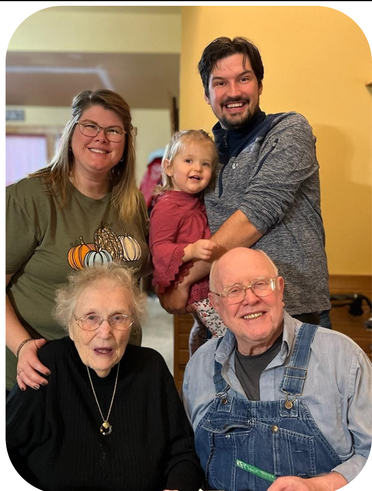
5 generations of our family. We were so blessed by the faithfulness of Grandma Great.

- For the spiritual health of our family as we travel.