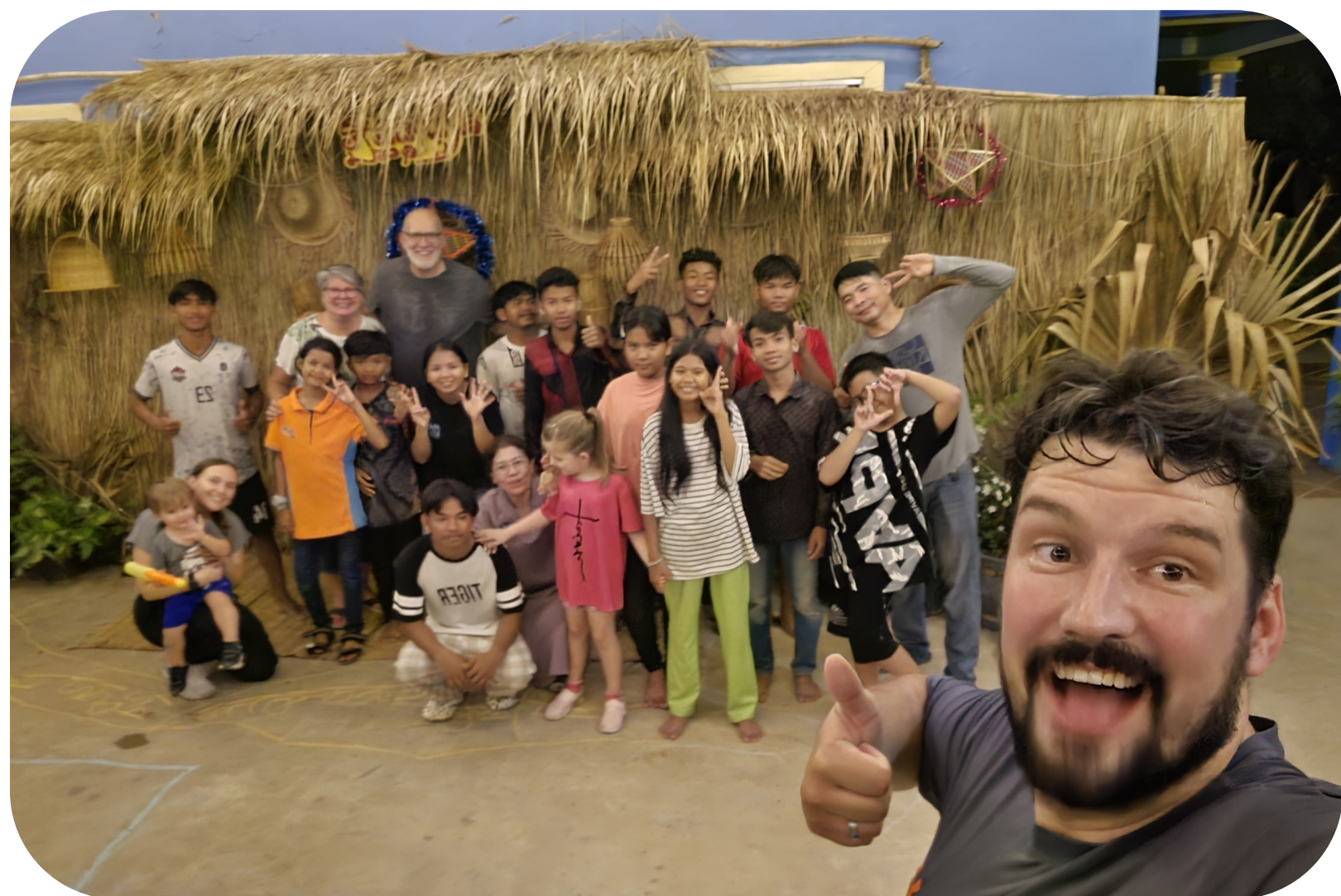
During Khmer New Year we were blessed to spend the day in Takeo with some of the kids and teens from WORD!