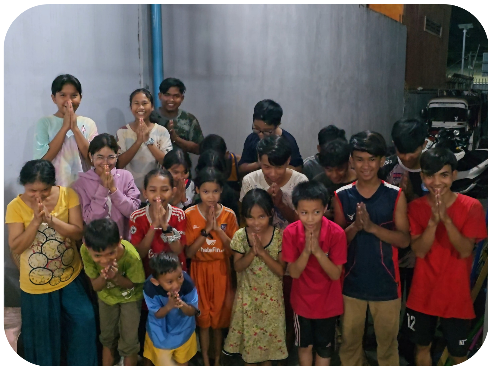
The Children's home says "Ah-Koun" or "Thank You!" For donating to help repair their home!