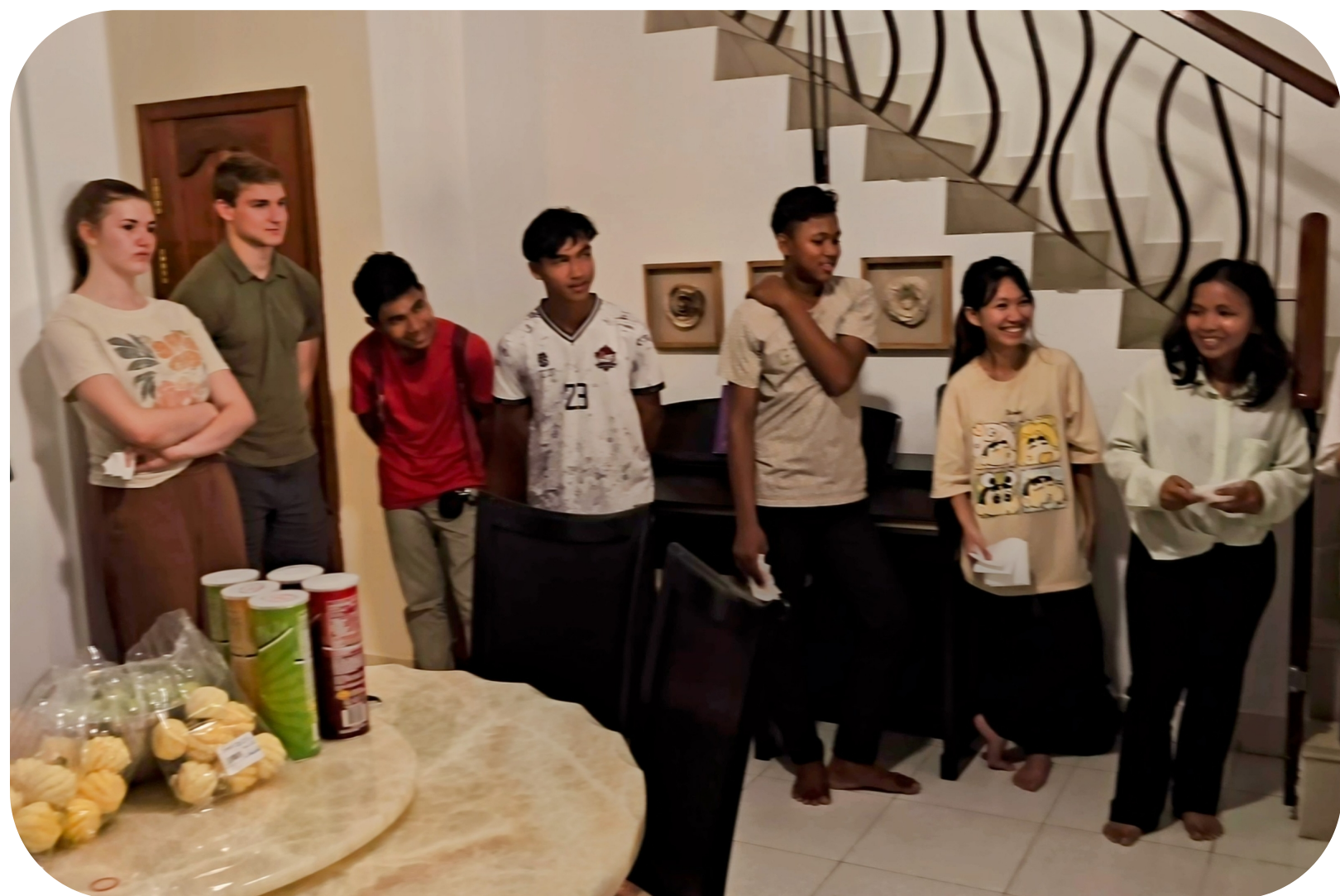
A small group of teenagers that we were able to start meeting with this past Sunday for Bible Study!