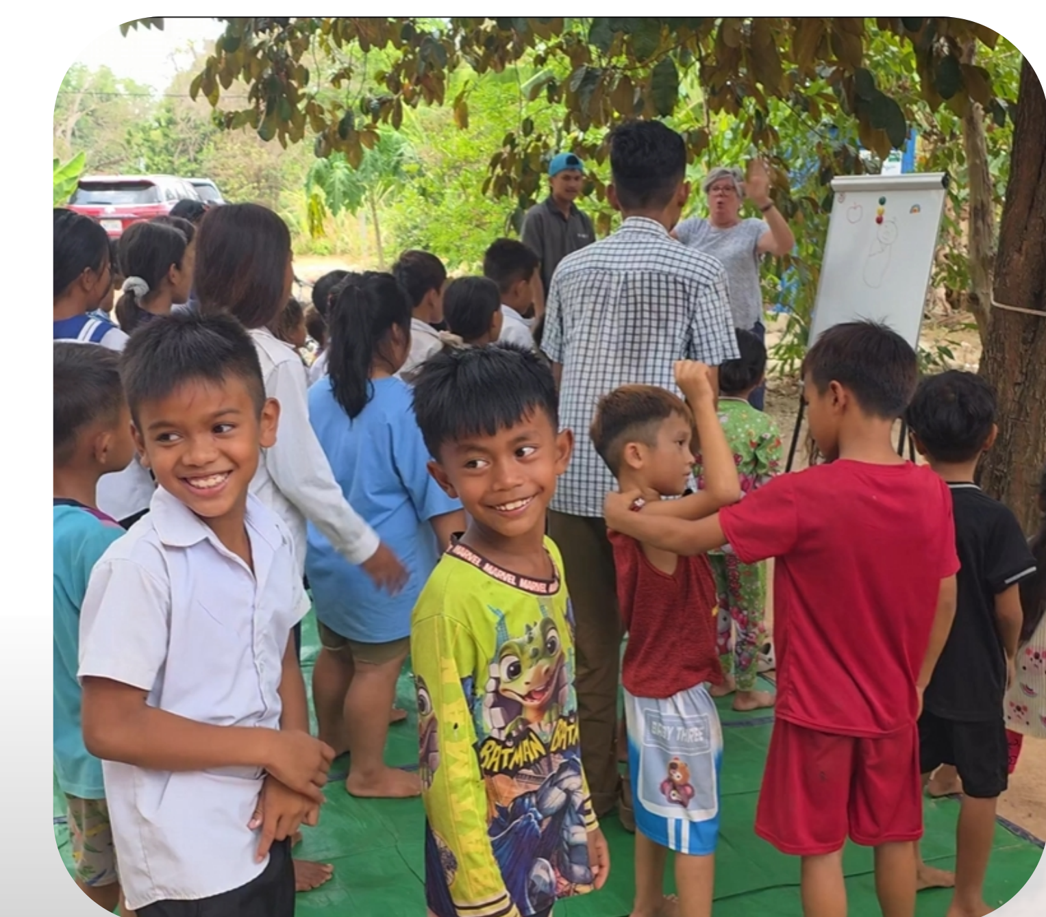
A group of our kids from KPC that we teach the Bible to weekly! We cannot go while in language school, please pray for them!