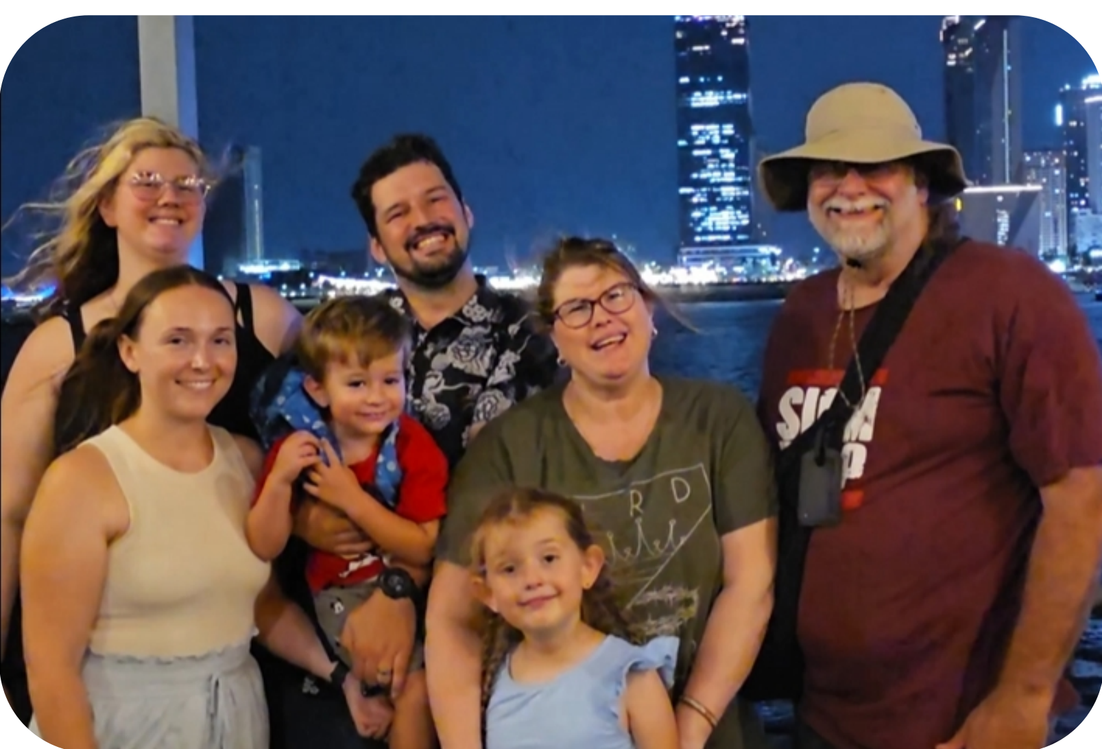
Our Family was able to visit us over Khmer New Year! We are so incredibly thankful for this time.

- A fruitful furlough in 2027 and new long-term ministry partners.