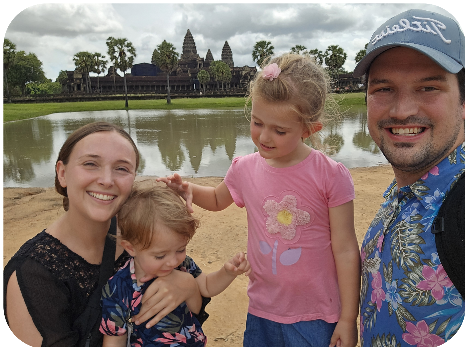
Taking our Kids to Siem Reap and visiting the Angkor Wat 9 years after our first trip.

Nine years. Exactly nine years ago, we arrived in Cambodia for the first time. Back then, we had no idea what God had in store for us and our eventual family. Just two weeks ago, we landed in Cambodia with the kids for the summer! God is good, and we can't wait to show you what He has been doing.