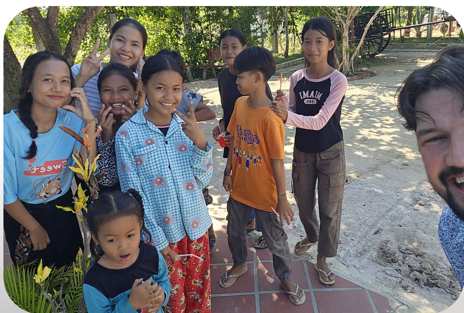
Seeing some of our close friends from the Children's Home and NLBC of Takeo.