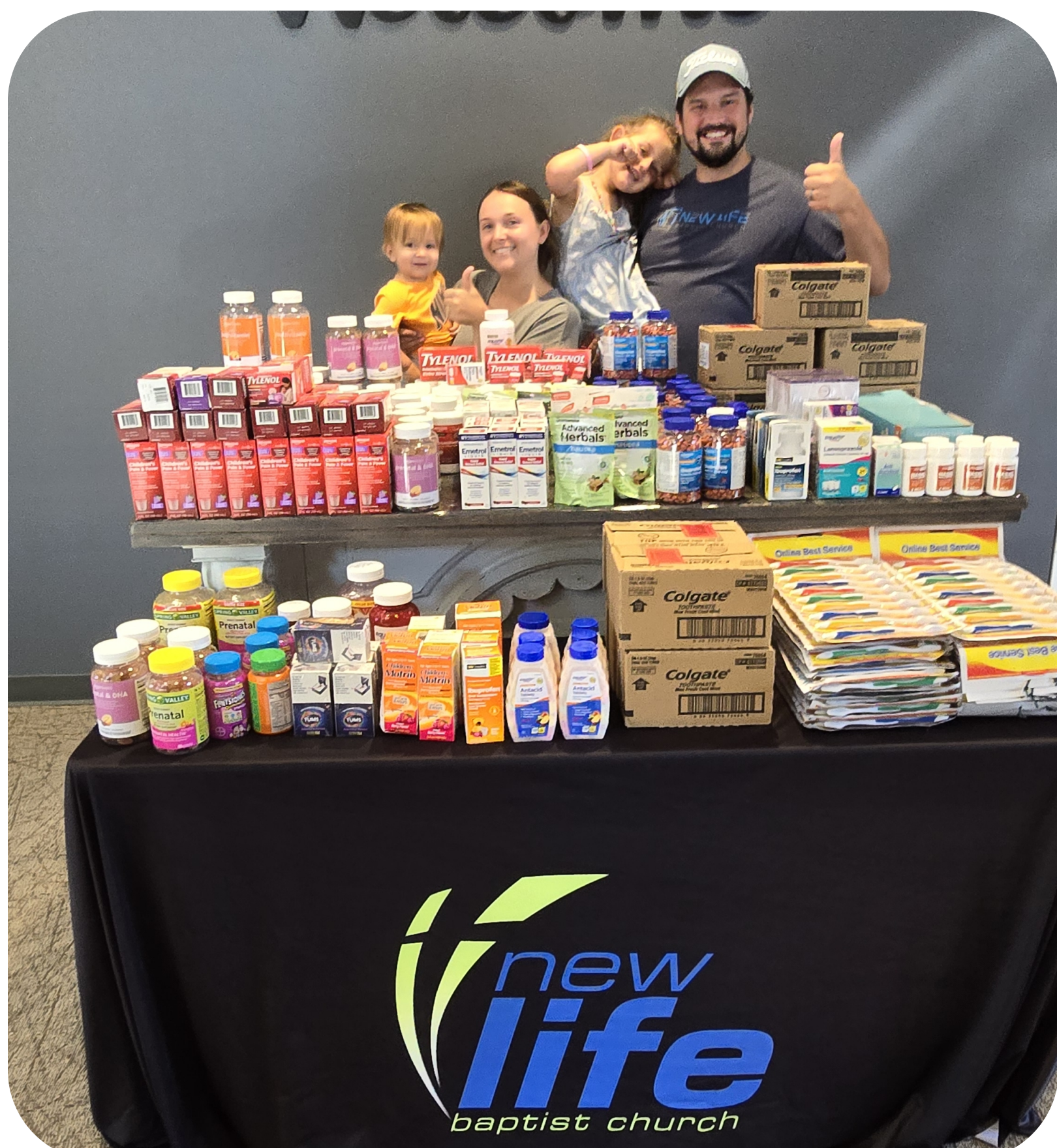
The Medicine that YOU donated to show the love of Christ to the people of Cambodia. THANK YOU!

- That we would continue to learn and utilize the Khmer Language