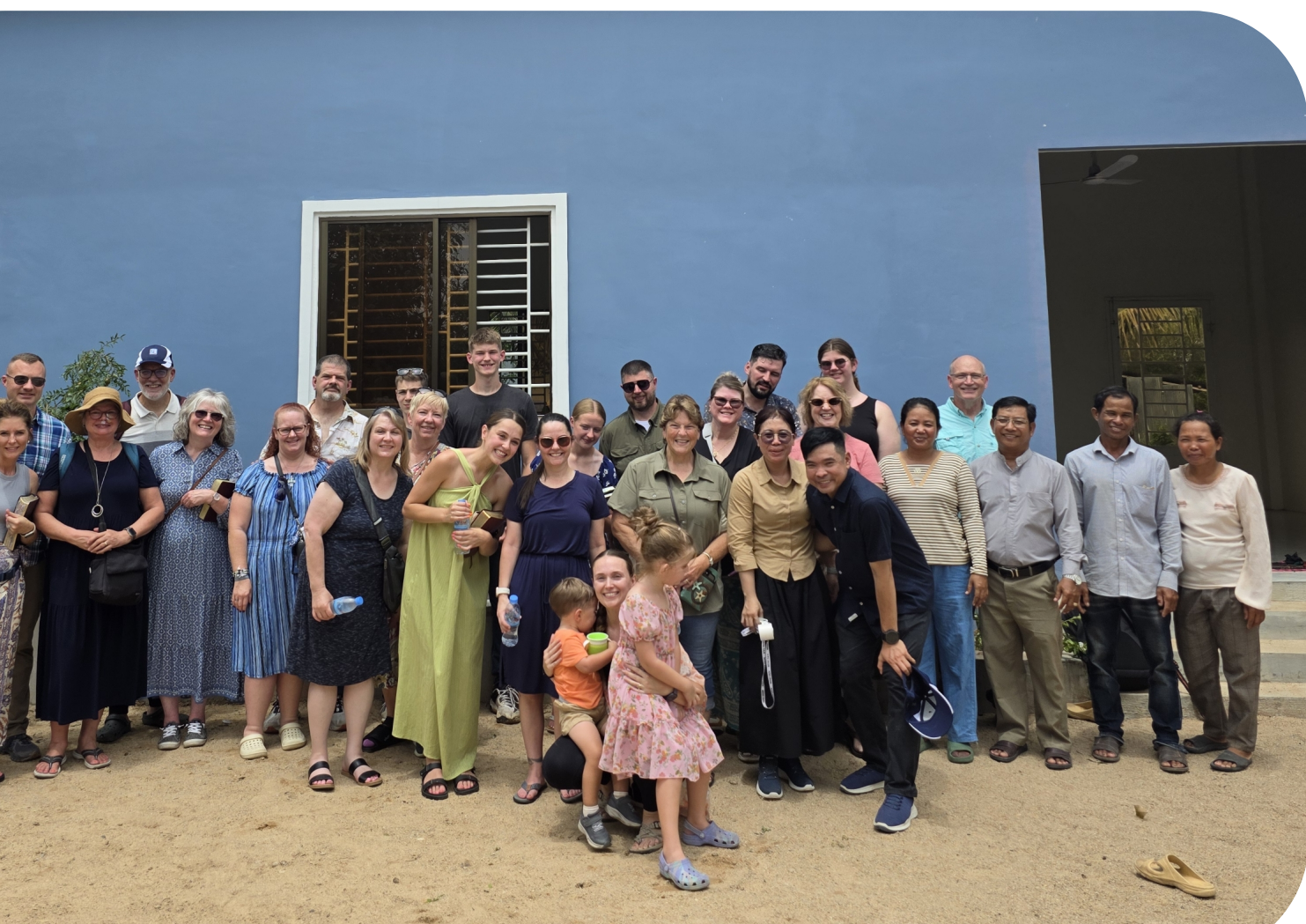
Our group of 18 from New Life Baptist Church that came to visit and serve! God did some wonderful things.

- For the Khmer we are building relationships with will come to know Christ.