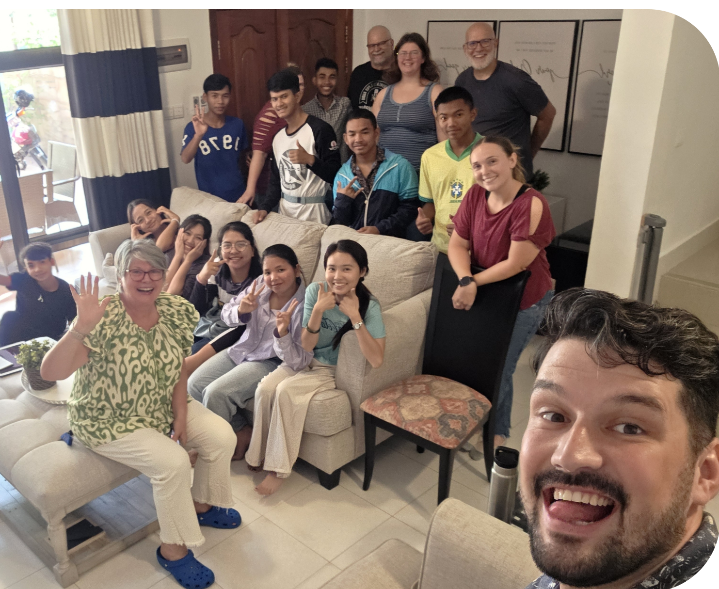
We meet with around 10 young adults for discipleship and bible study every Saturday with our partners the Donovans!