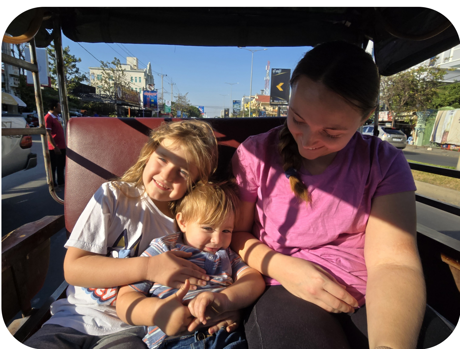
The kids remember riding in a TukTuk and they love it!

We have finally made it to Cambodia! After 18 months of deputation, 7 years since surrendering to the call of missions, 10 years of marriage, and two children, God has faithfully brought us here to serve Him. All glory and praise go to Him alone. We are humbled and thankful that God used you—your church, your love, your prayers, and your support—to get us here so quickly.