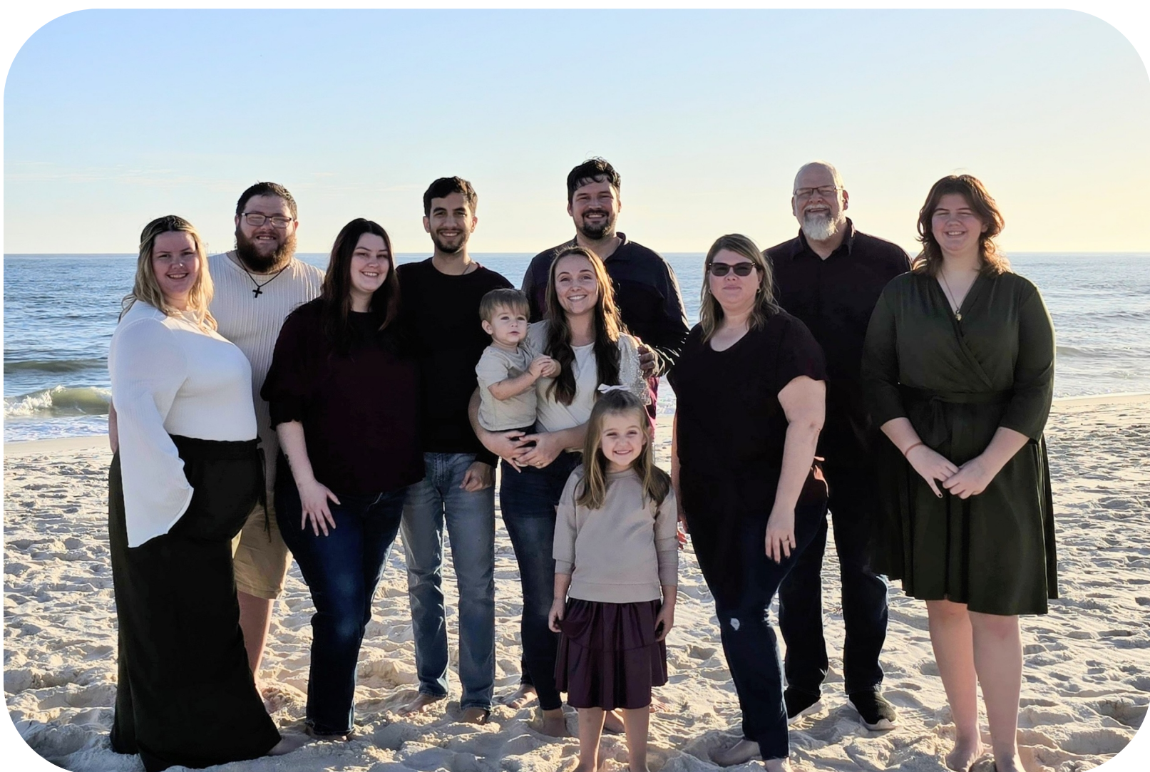
Our time together with family was so special before we left on January 9th