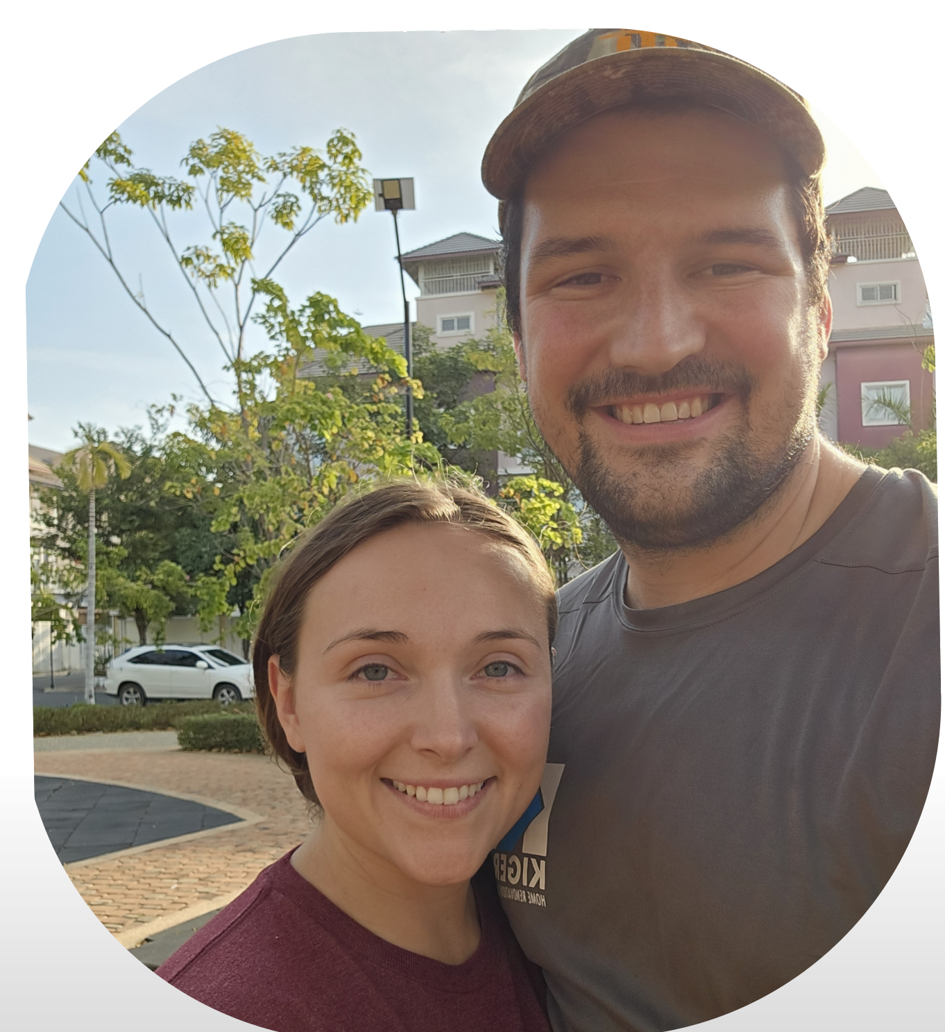
Home. Thank you for all of your love, prayers, and support.

- For us to study and learn Khmer well to minister for years to come.