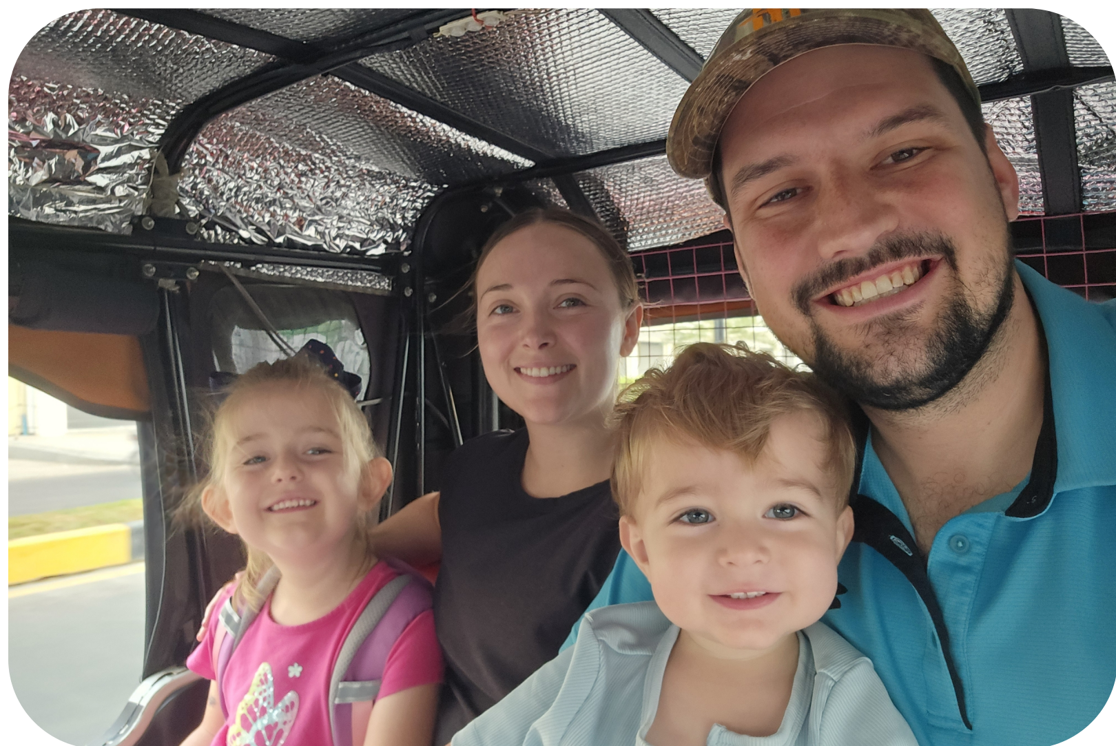
Thank you for partnering with us to reach the people of Cambodia with the Gospel of Jesus!