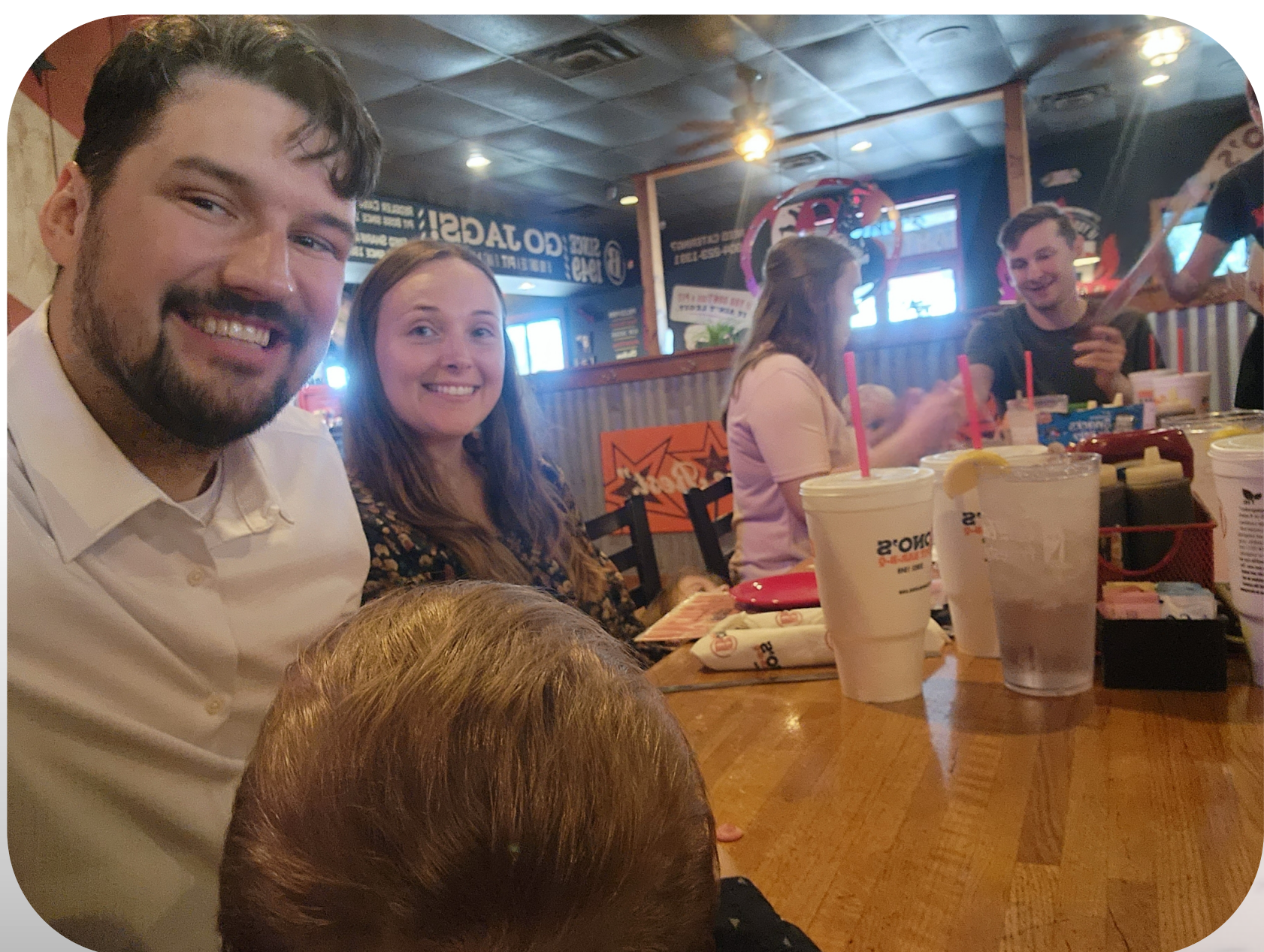
As we visited churches across IN, FL, AL, & TX we were thankful to spend time with both old and new friends!