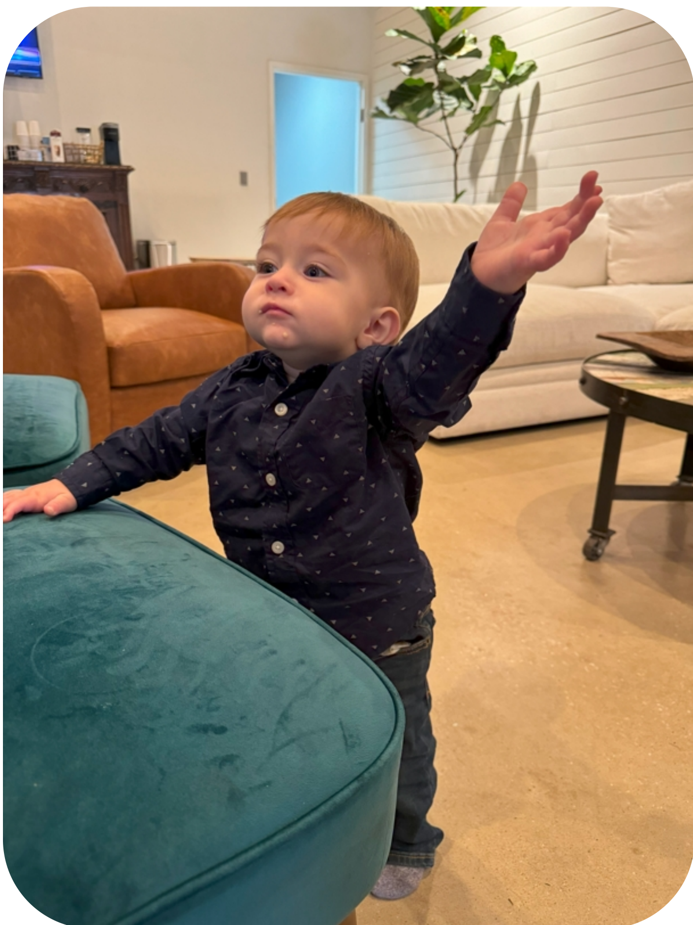
Kaladin showing off just a bit.