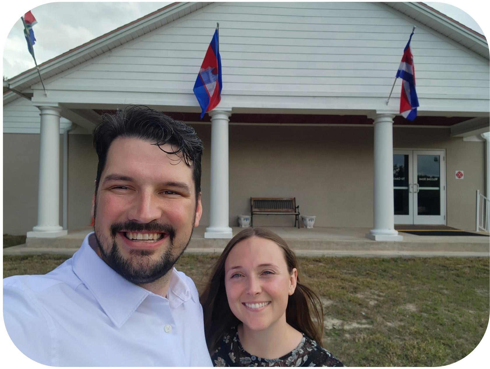
Blessed to be at GBBC's Mission Conference and to have wonderful new partners in our ministry!

- Pray and thank God for His amazing provision, as we trust Him to provide for our needs and guide us through this journey.