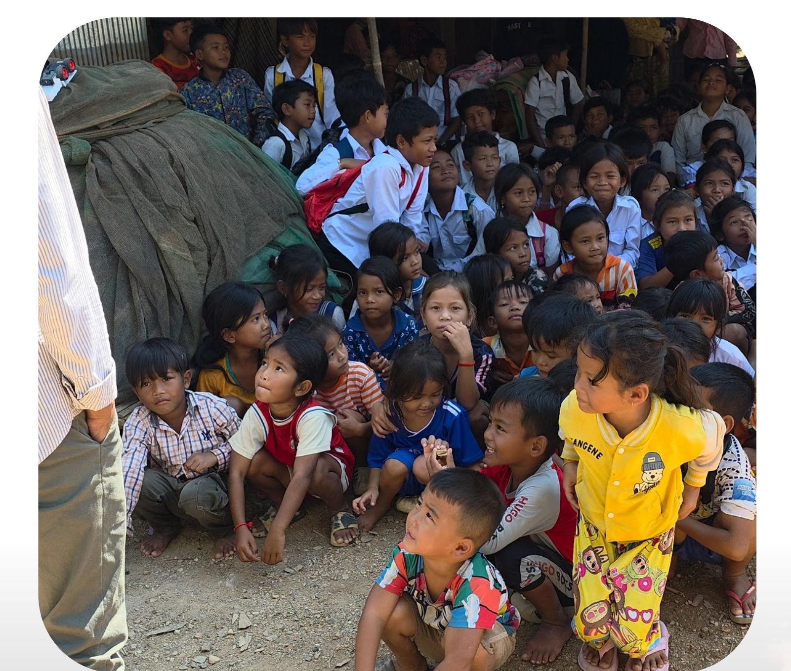
One of our recent outreach trips into the River Village! Many here have come to know Christ, please pray for this community.