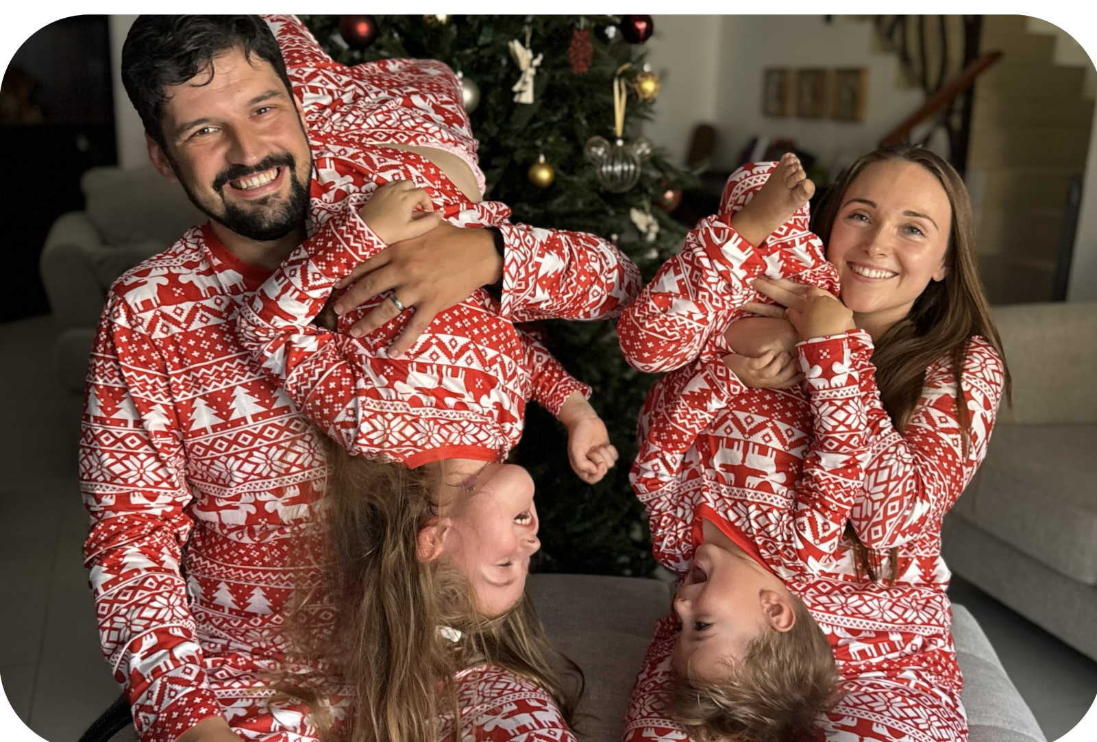
Merry Christmas! Thank you for your continued love and support for our family!