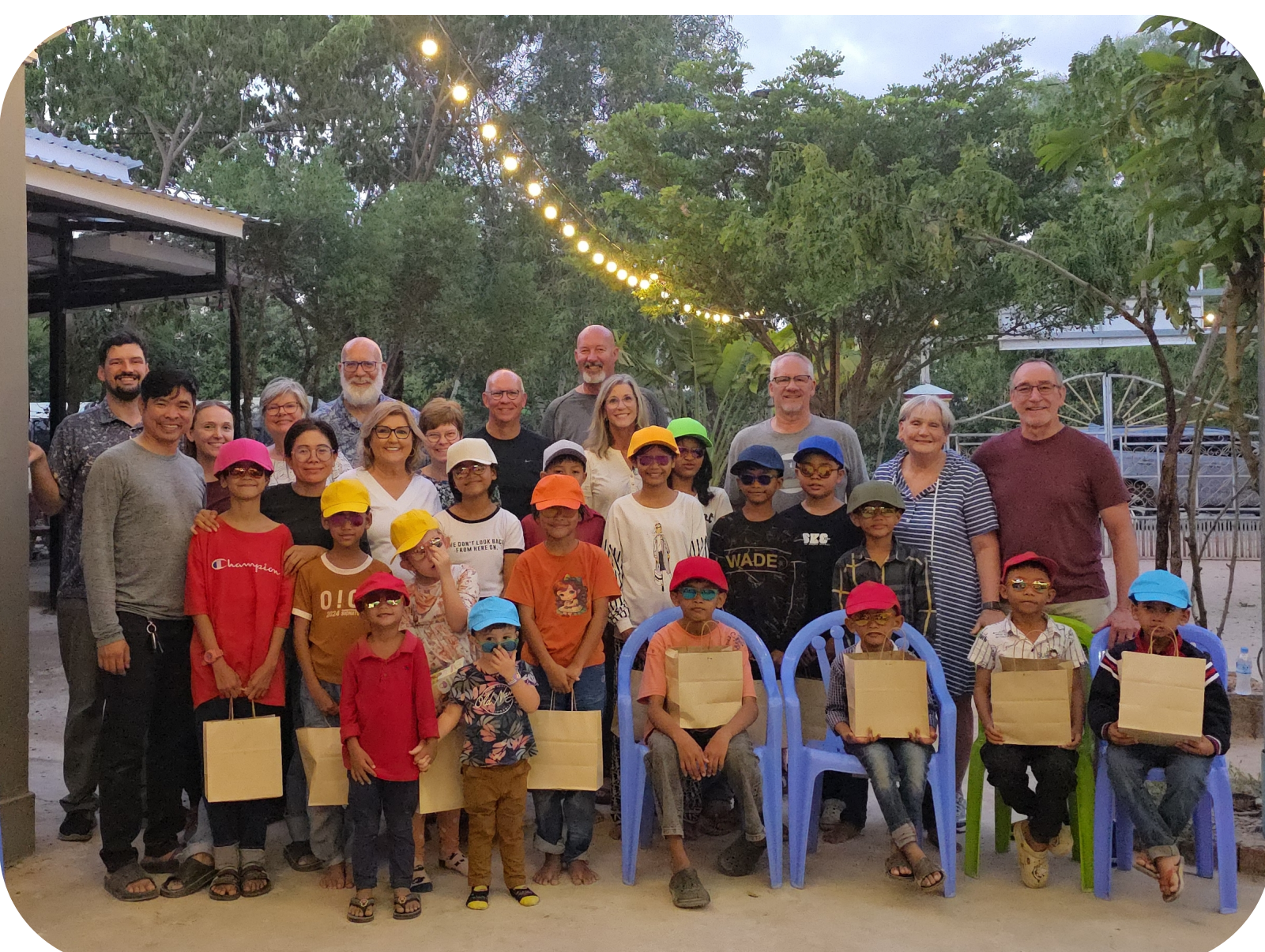
Our recent time with High Street visiting and an incredible Christmas Service at our Church in Takeo!