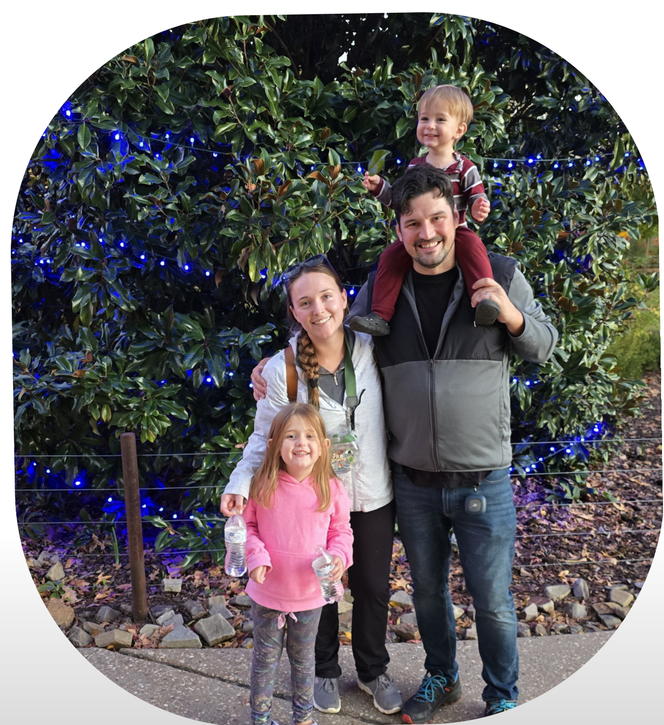
The past 18 months traveling with just the 4 of us has brought our family so incredibly close. We will cherish this time for our entire lives.