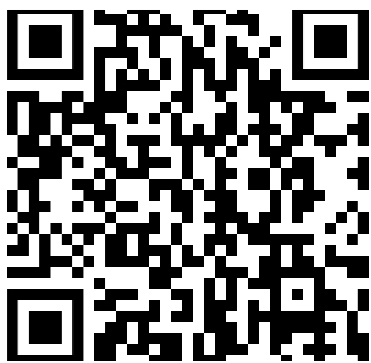
There is still time to donate medicine before we leave, please scan the code above to donate, Thank you!