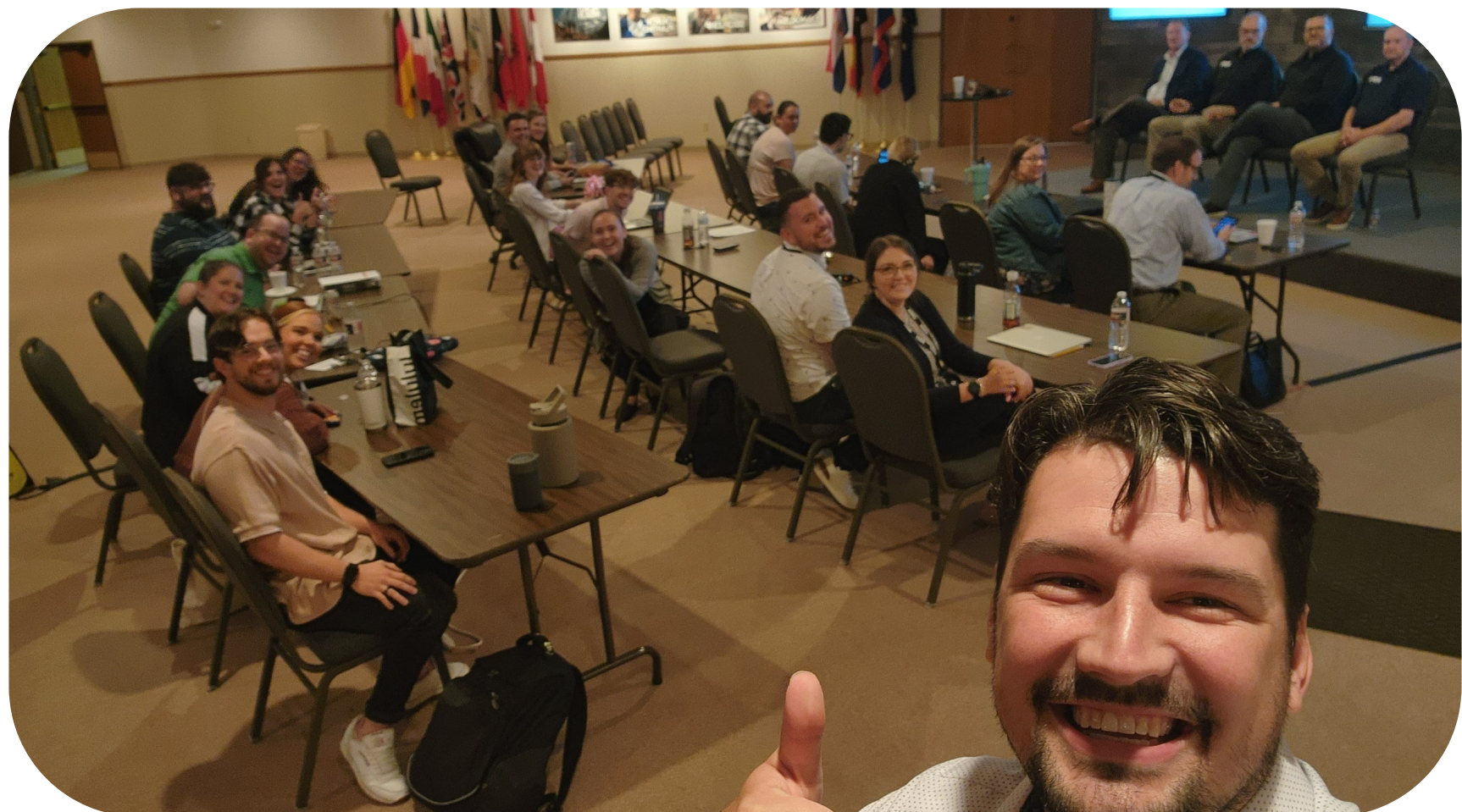
19 other wonderful missionaries who are hungry to know and follow God deeper!

- That God would supply our home Church, New Life, with the right youth pastor to reach and lead our teens and others in the community.