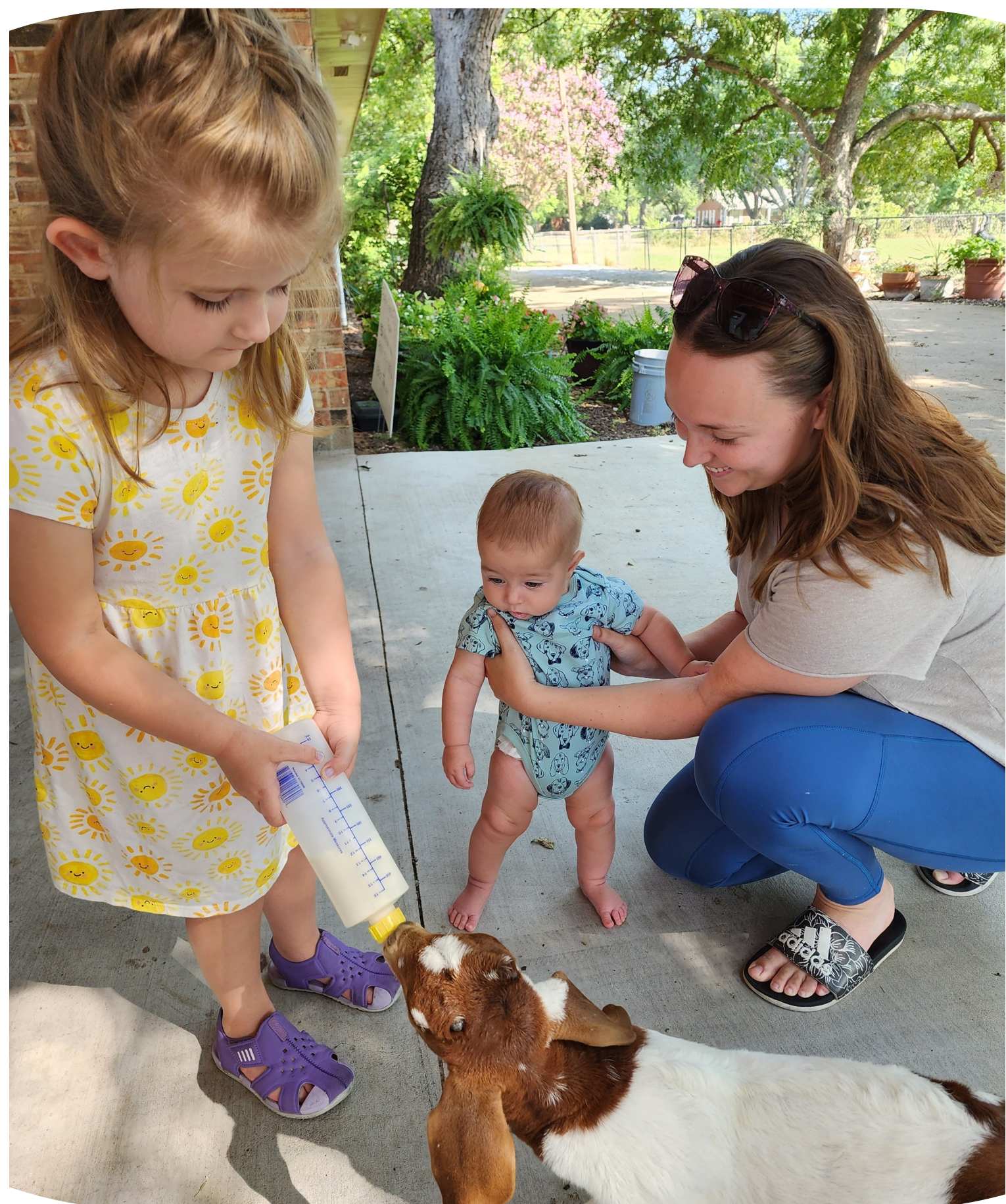
Feeding goats is one of the things we stopped to enjoy as a family on the road.