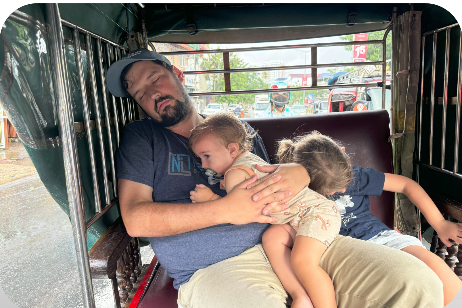
How we all feel after the past two months adjusting to our new life in Cambodia!