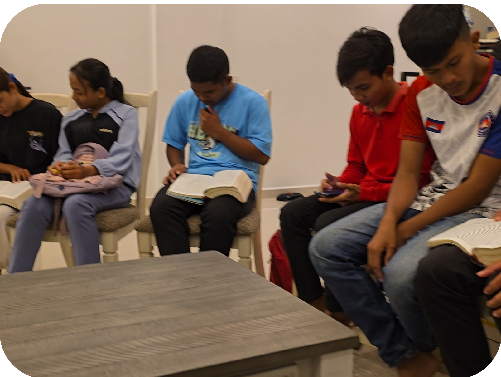
Having a Bible Study in our new home with some of the older kids from the Children's home.

- Continued financial provision for our setup costs as we prepare for our permanent move to Cambodia.