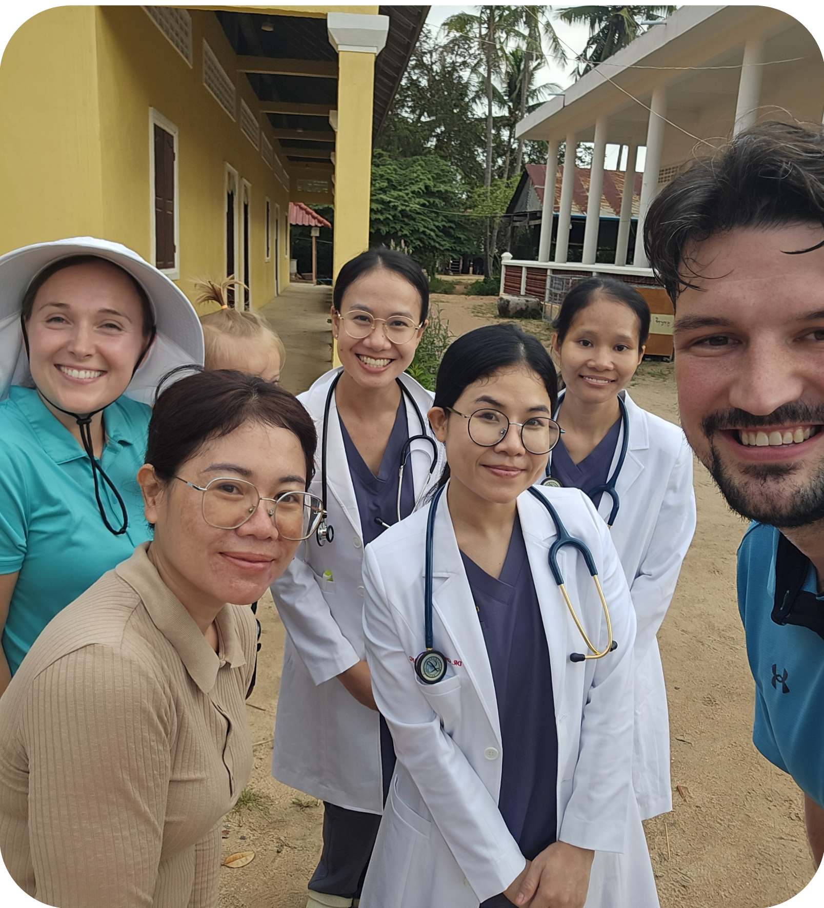
Our Health Clinic Team! God used these ladies to show the love of Christ to many for the first time.