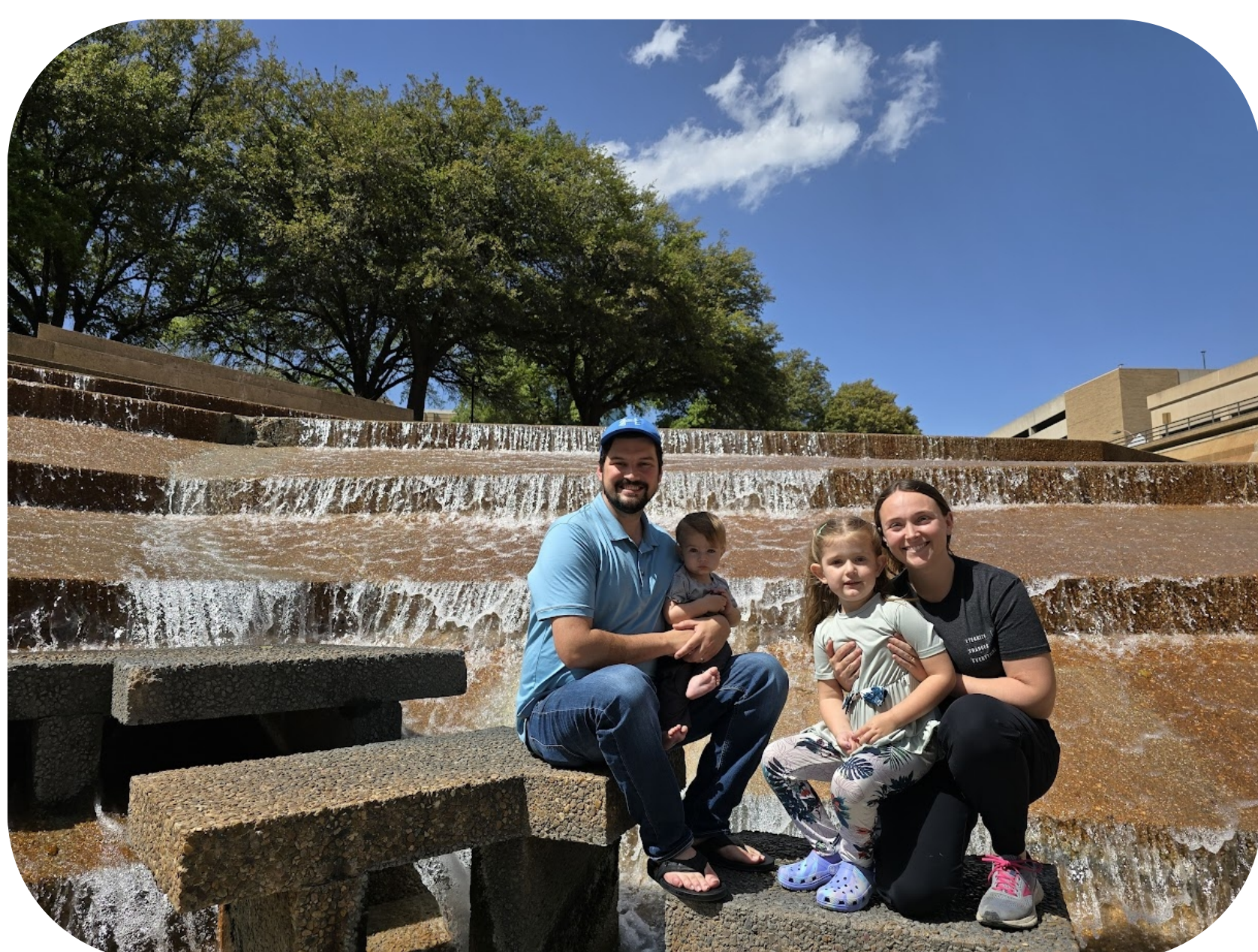
We got the opportunity to take a family day to the Fort Worth Water Gardens and walked around the city, it was beautiful!

- For safety as we travel and for the kids to enjoy this time on deputation!