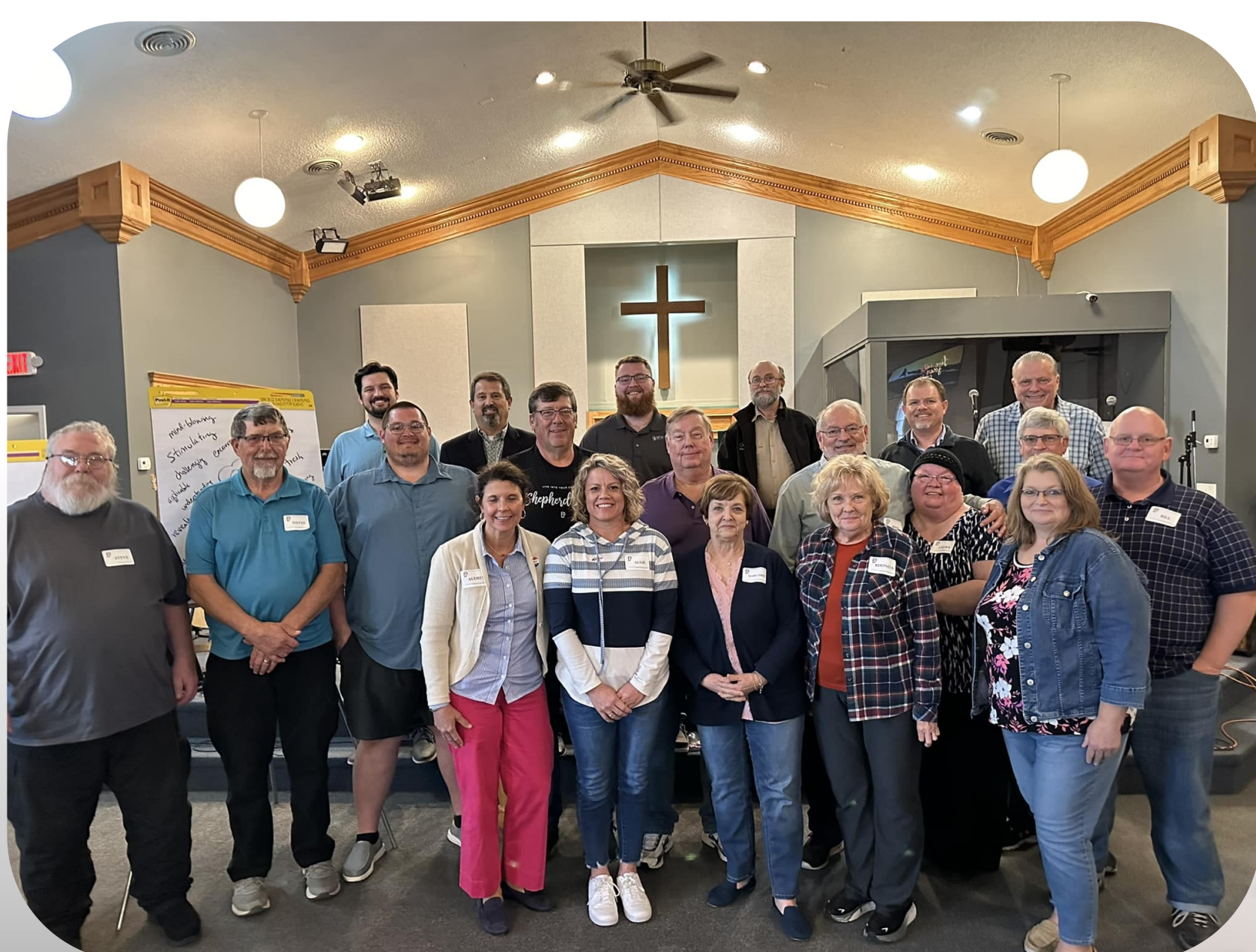
We were blessed to be able to join the OKBBF for Presence Point's "Shepherd Leadership" conference. It was great to learn more about Biblical Shepherding.