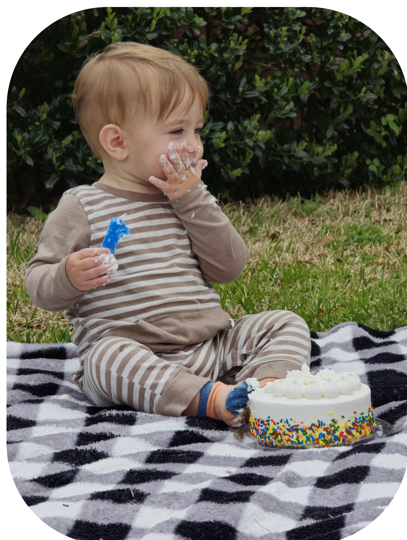
Kaladin turned 1 on March 21st!